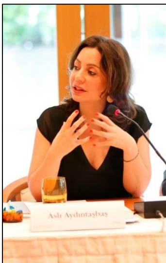
Bottom left: Turkish journalist Asli Aydintasbas