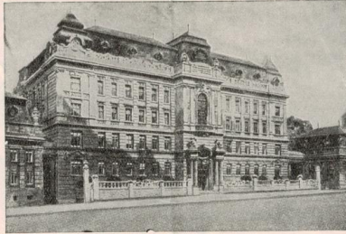
Nach einem Aquarell von Erwin Pendl