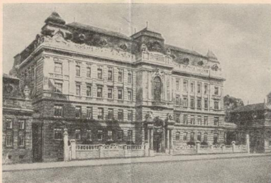
Nach einem Aquarell von Erwin Dendl

TELEGRAMMADRESSE: KONSULAKADEMIE WIEN POSTSPARKASSENKONTO Nr. 127.020